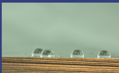
NPL water repellency