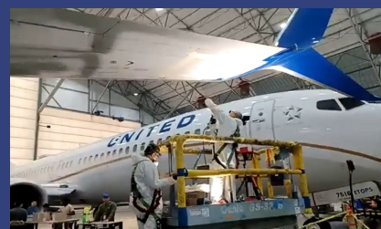
Boeing 737 Wing Section Protection