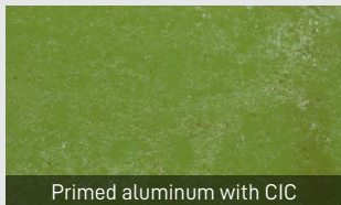
Primed aluminum with CIC