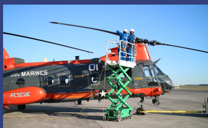
Application on Rotor Blades for a H-46 Sea Knight

APW100 functions fully under extreme temperatures ranging from -110^{\circ}\text{F} to 400^{\circ}\text{F} ( -80^{\circ}\text{C} to 204^{\circ}\text{C} ). Due to its durability, only a thin film ( \sim 0.001 in. or 0.025 mm) is needed to provide corrosion and erosion protection. With a lower dry weight than traditional corrosion-inhibiting compounds, it also achieves significant weight savings. AeroPel APW100 is made in the USA and formulated to be non-VOC and chromate-free, aligning with the industry's priorities for next-generation aviation coatings.