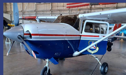
Application to protect Texas Civil Air Patrol Aircraft